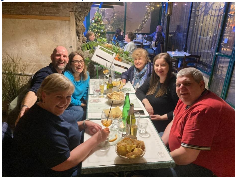
Our fantastic Family School Network team

Ending our meeting with a social dinner (which as you would expect in Rome was fabulous)